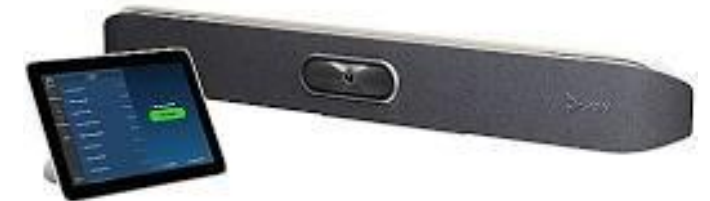
Poly Studio X50