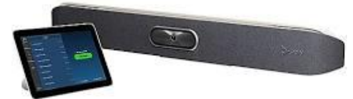
Poly Studio X50